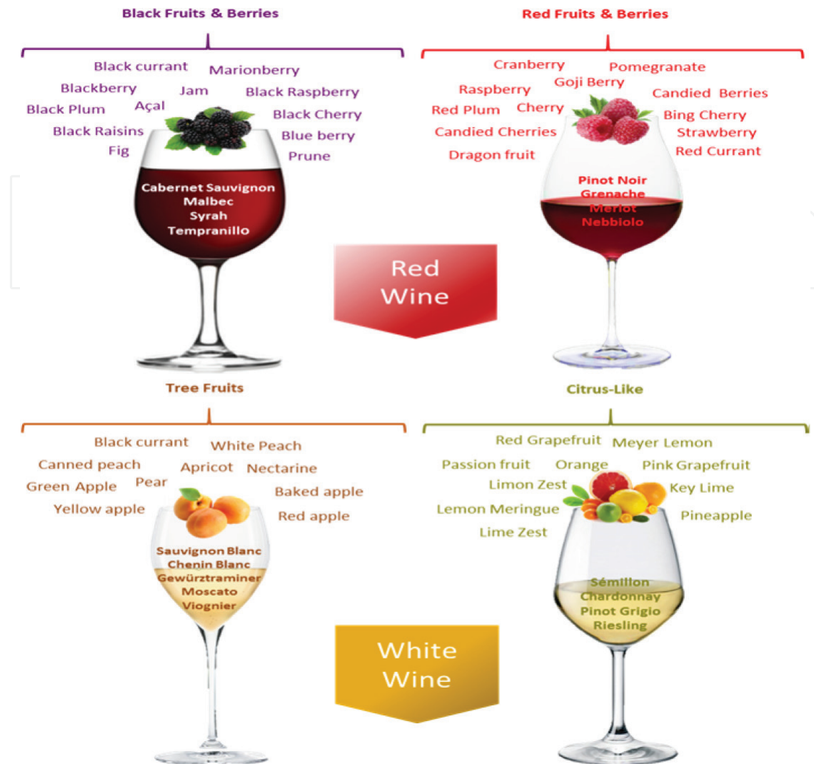
Figure 2. Fruit flavours in the red and white wine.